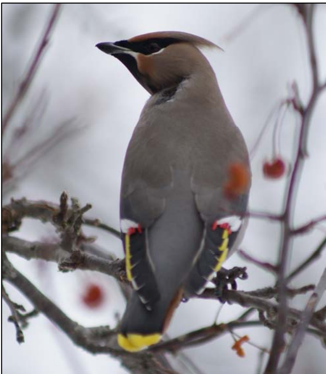
Bohemian Waxwing.