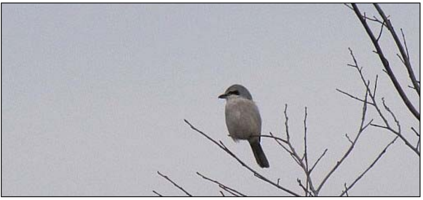
Northern Shrike, Base Line rail trail, November 18, 2012.