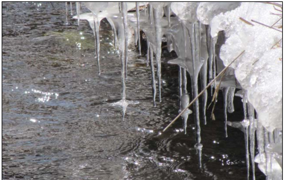
At last, a thaw! TCT, Base-David Fife Lines, March 25, 2013.