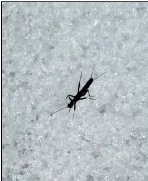
One of a dozen little snowflies, Allocaupnia sp, on TCT, Base-David Fife Lines, March 25, 2013.