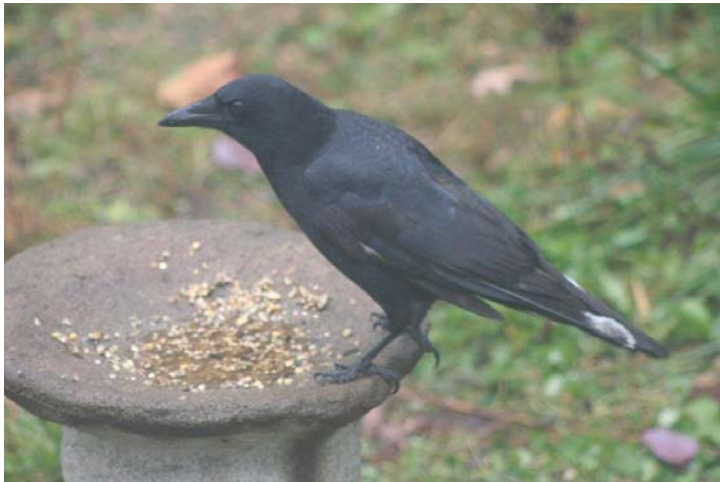
American Crow visiting yard in Peterborough – note the white on tail and shoulder (partially albino). Photo by Martin Parker, 30 October 2013.

Published 9 times yearly, Publication Mail Agreement #4005104