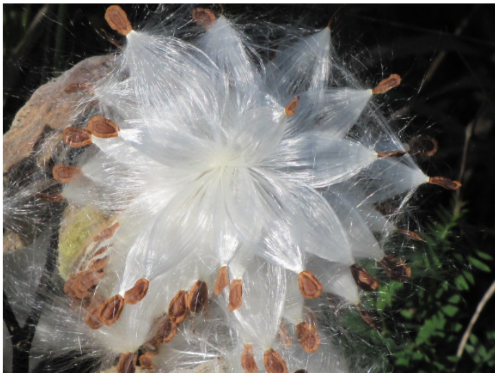
Common Milkweed. October 28, 2013.