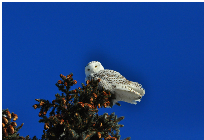
Snowy owl, as originally shot and composed by Enid Mallory, December 2013. (Recognize this? CG flipped it horizontally for the cover photo. Great shot, Enid!)

http://peterboroughnature.org/nature-studies/christmas-bird-counts/results-2013