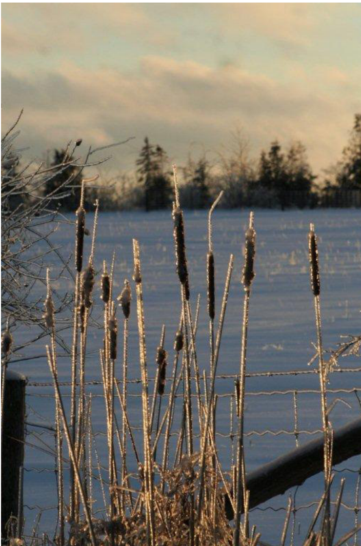
Cattails after ice storm