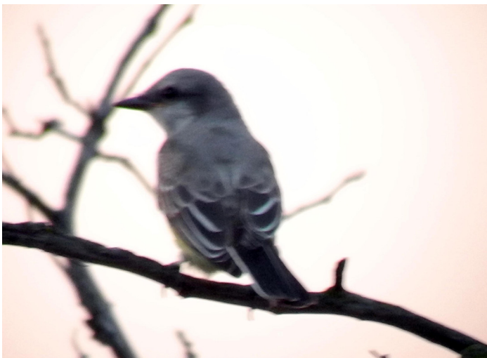
Western Kingbird, by Dave Milsom

Just before dusk on Monday, August 26th, a Western Kingbird caught insects in the air after flying out from birch trees just behind my deck at 1093 Scollard Drive, Peterborough. This continued for about 10 minutes until the bird flew into the woods, presumably to roost for the night. Photos were taken through my telescope .