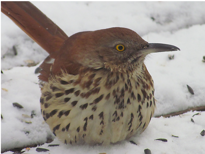
Brown Thrasher, late December, 2013, Rochelle Court, Peterborough ON