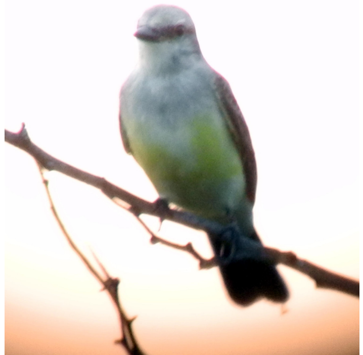
Western Kingbird