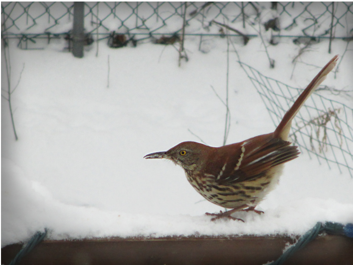
Brown Thrasher, late December, 2013, Rochelle Court, Peterborough ON