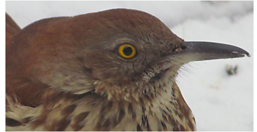
Brown Thrasher