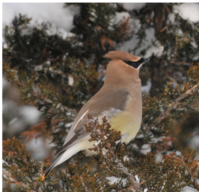
Cedar Waxwing Lakefield1 (on CBC), 15 Dec 2013