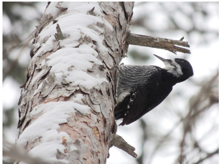
Black-backed Woodpecker, entrance to Petroglyph PP, 2 Jan 2014