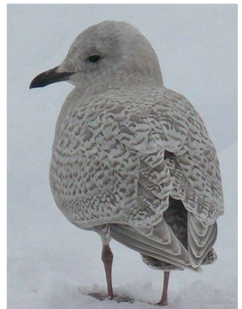
Above: Glaucous Gull, Adult Right: Iceland Gull, Kumliens Race Parry Sound District, December 2012 and December 2008 Submitted by Stephen O'Donnel