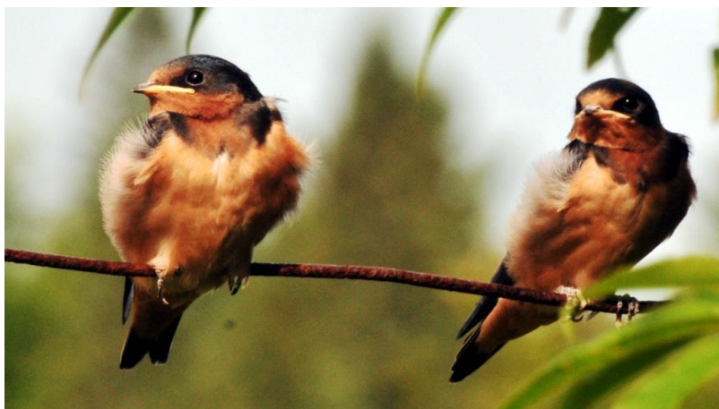
Baby Barn Swallows, Carden Alvar, July 28