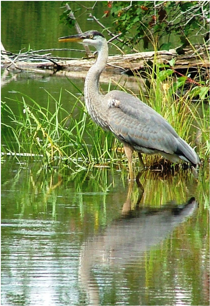
Great Blue Heron, Indian River at Warsaw Caves, August 24