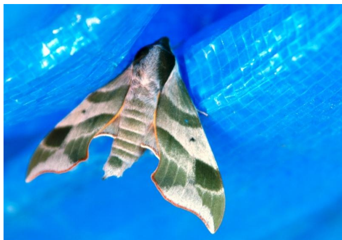
Virginia Creeper Sphinx Moth, Lakefield, June 14