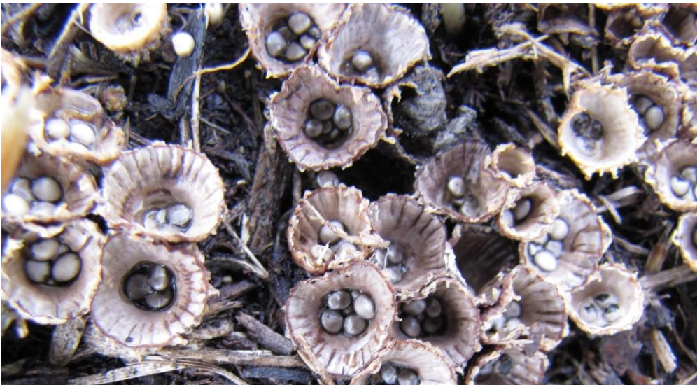
Grey Bird's Nest Fungi August 17