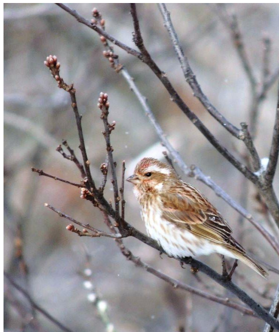
Purple Finch

Contact: Please call 905-352-1008 to register