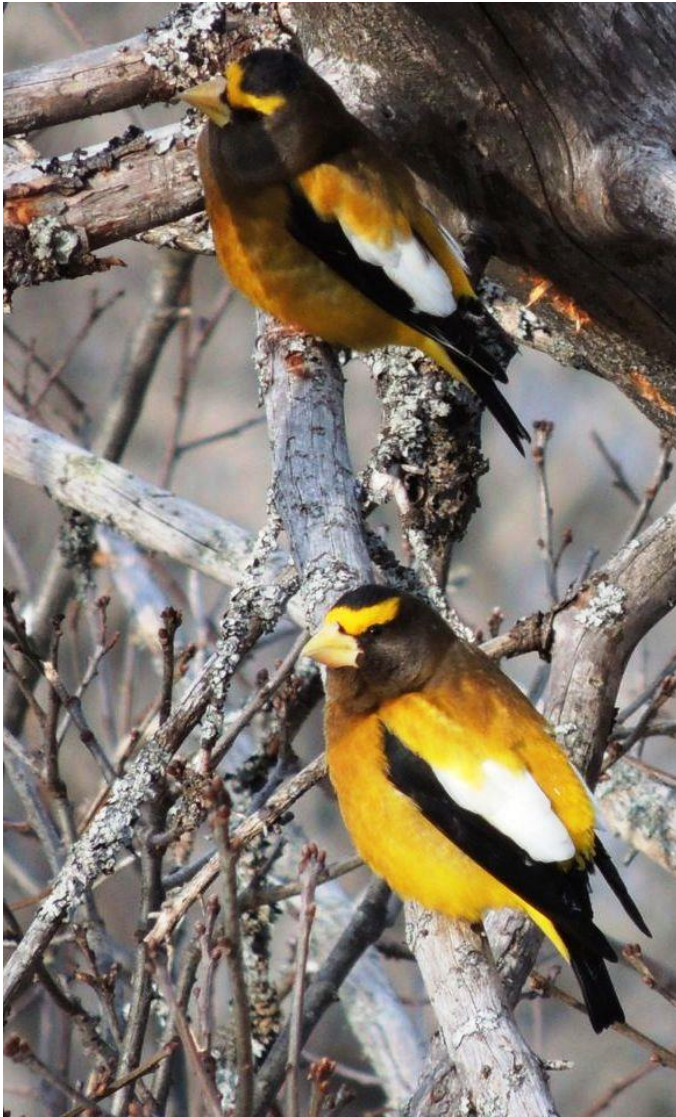
Evening Grosbeaks ~ Submitted by Luke Berg