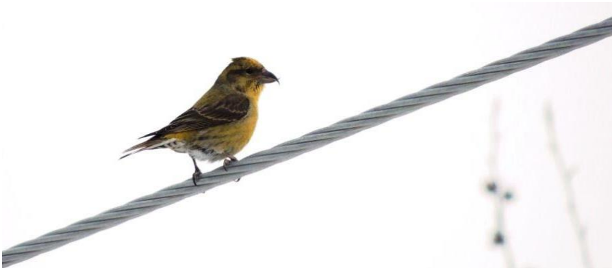
Red Crossbill, Female ~ Submitted by Luke Berg

Central Ontario: Pine Grosbeaks will be present for the good crops of mountain-ash berries, sunflower seeds in bird feeders, European mountain ash in domestic gardens, and ornamental crabapples.