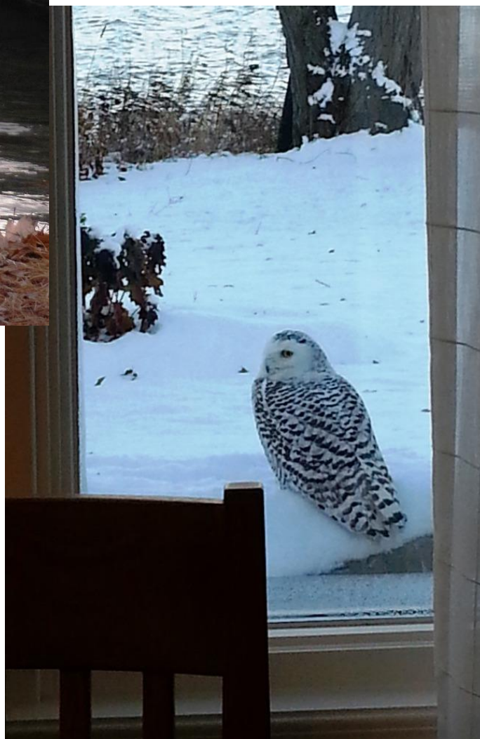
Right: Snowy Owl, north of Lakefield, November 18