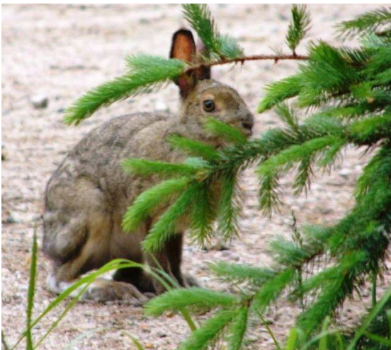
Snowshoe Hare Sundridge, June 2006