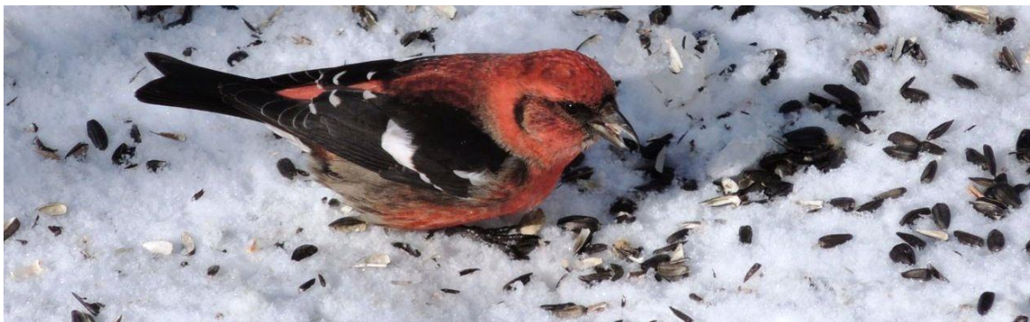
White-winged Crossbill, Male