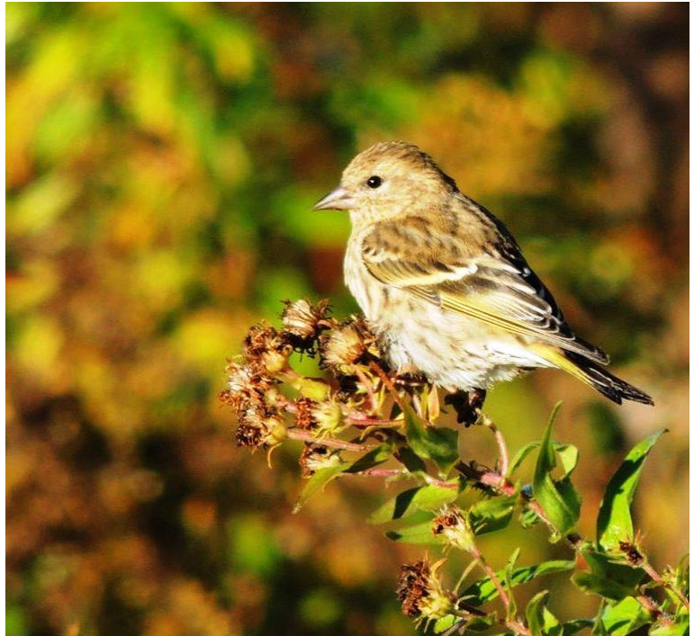
Pine Siskin

A small number of Evening Grosbeaks will be seen, feeding on kernels inside cherry pits and other fruit, and seeds of box elder, maple and ash trees. Evening Grosbeaks will also consume black-oil sunflower seeds in feeders. Good thing they have strong bills! Poor crops in the north will entice Purple Finches south to feed on sunflower seeds. One bird can consume 360 seeds in one half-hour and go on to eating other seeds when finished!