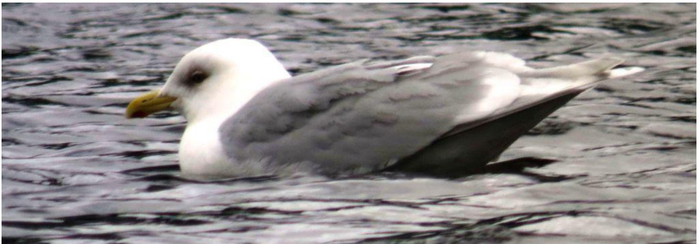
Iceland Gull, Kumleins Adult, Otonabee River, April 1