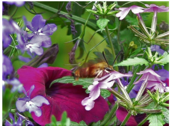
Photo of Snowberry Clearwing moth June 31.