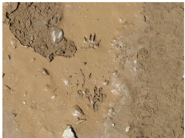
Red Squirrel tracks