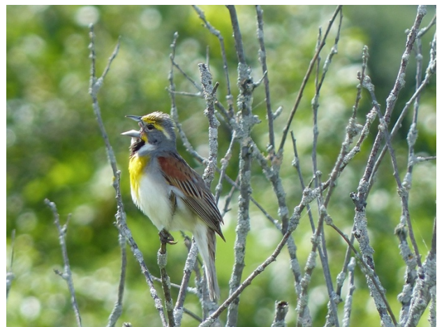
Photo of male dickcissel

http://joshvandermeulen.blogspot.ca/2017/07/dickcissel-invasion.html