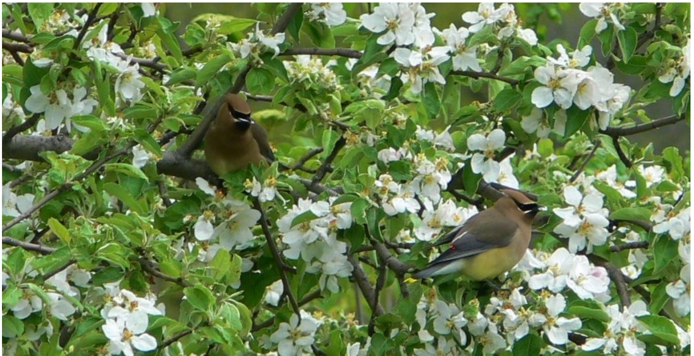
Cedar Waxwings in apple blossoms at Thickson's Woods.