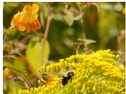
A bumblebee collects pollen from goldenrod near a showy patch of orange jewelweed at Lost Bay.

This comes on the heels of the world's largest study, published in Science journal. The study showed widespread evidence of population decline and shortened lifespans in