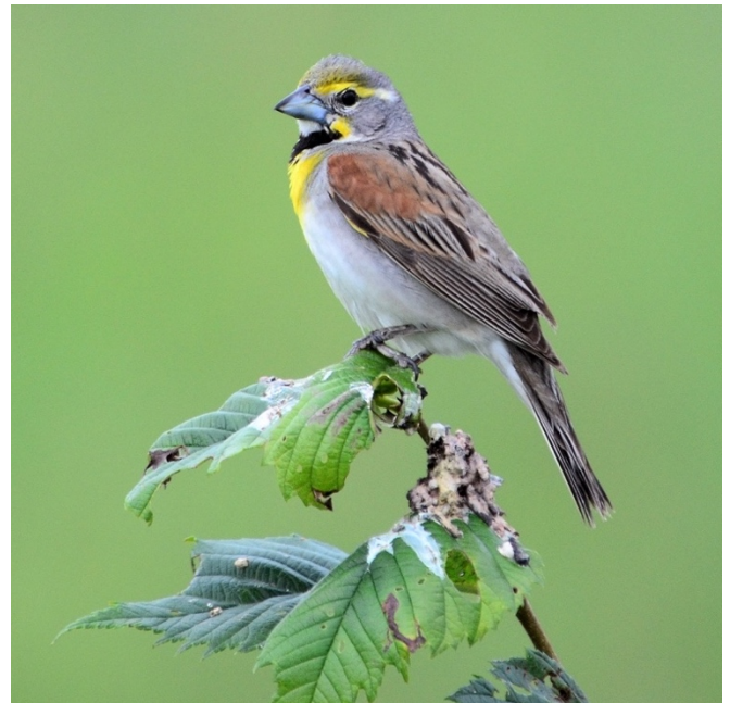
Male Dickcissel seen north of Fowler's Corners on July 12.