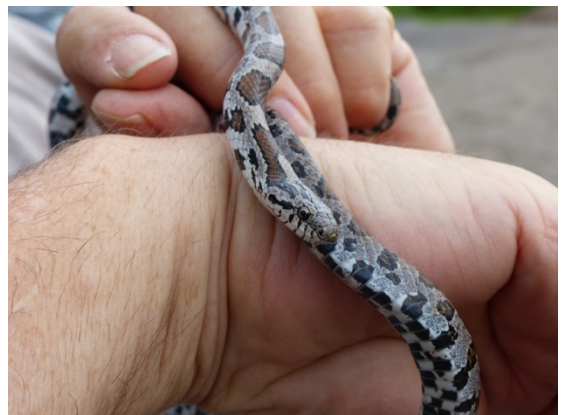
Eastern Milk Snake