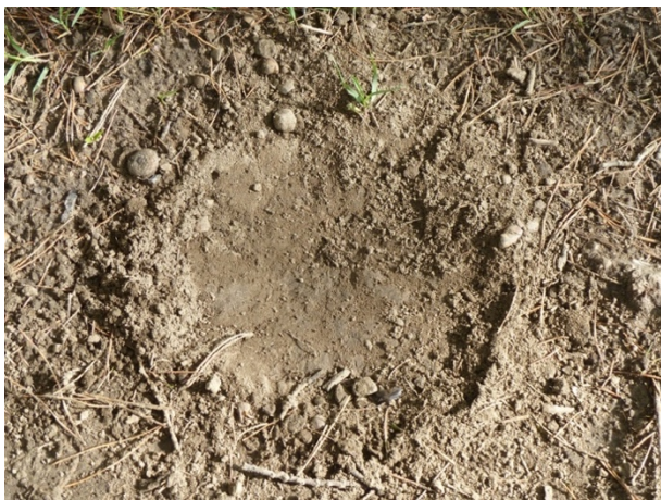
Ruffed Grouse dust bath

Wildlife tracking was hampered by the recent rainfall. Normally these trails and the nearby road allowances provide excellent summer tracking due to the presence of sandy sections. The damp, hard-packed sand did not provide ideal track making conditions. Observations included Ruffed Grouse dust bath, crushed Wild Turkey egg shell, Striped Skunk digs, Coyote scat, White-tailed Deer tracks and Red Squirrel tracks.