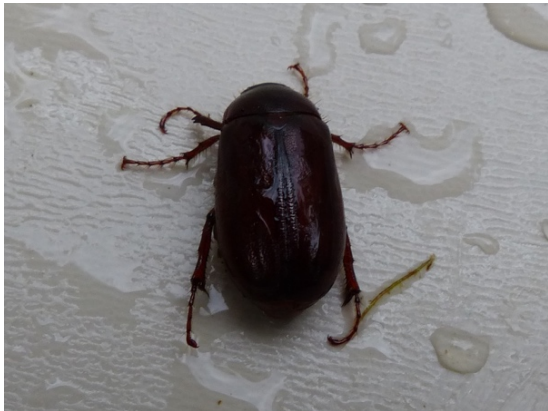
Beetle from the family Scarabaeidae