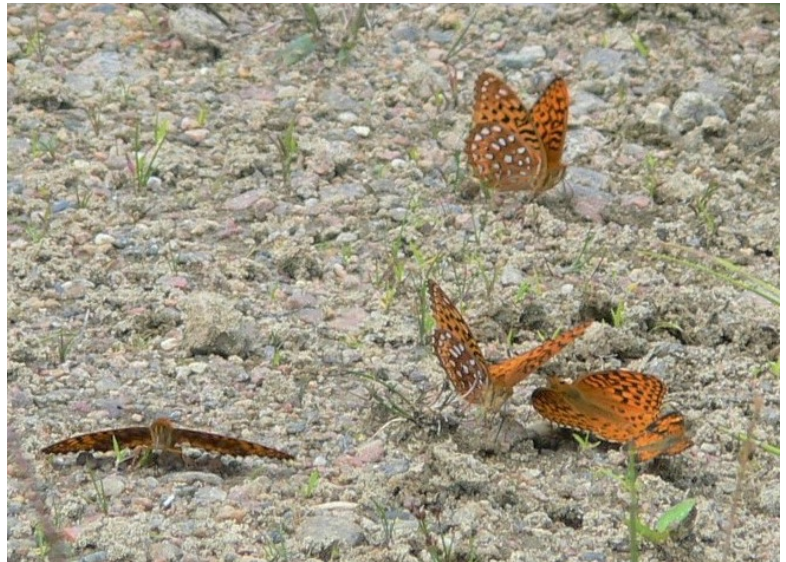
Aphrodite fritillaries "puddling" on the road at an old gravel pit site near Jacks Lake during butterfly count.

Refer to the following tables for full count results: