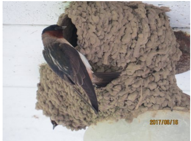
Cliff swallow's nest on a porch light on David Fife Line in mid-June.