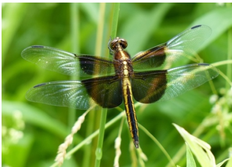
Widow Skimmer dragonfly

for weather updates: radar showed an intense band of rain on the way. The group soon appreciated the courtesy of Viamede Resort as we waited and watched in awe while the storm roared by.