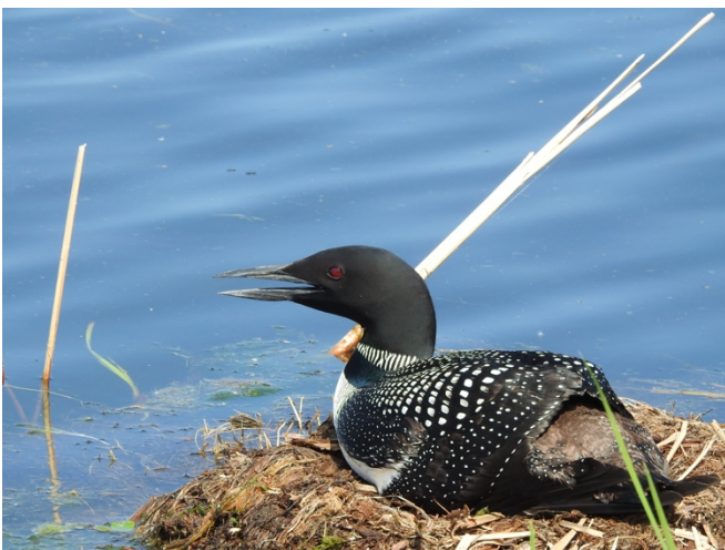
Loon at Lock 25 on June 9.