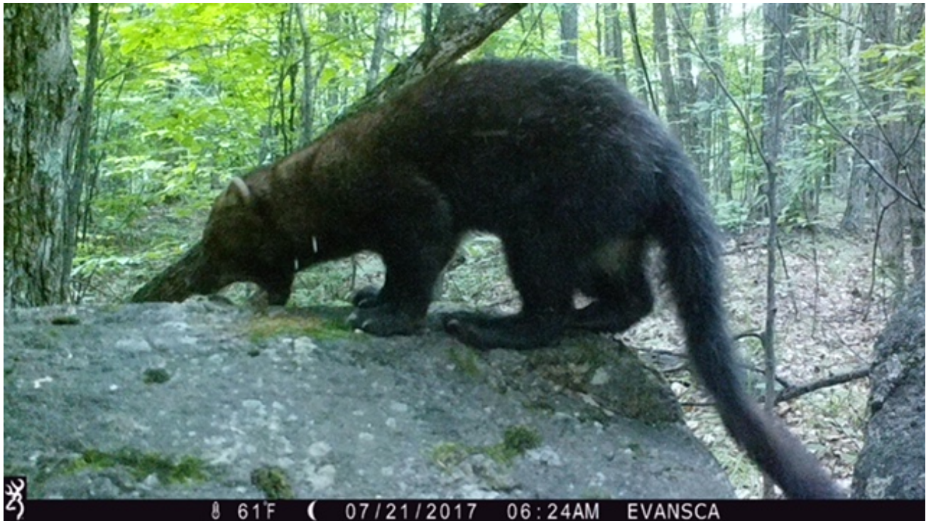
Trail camera photo of a fisher at Eel's Lake, North Kawartha Township on July 21 submitted by Evan Pinther.